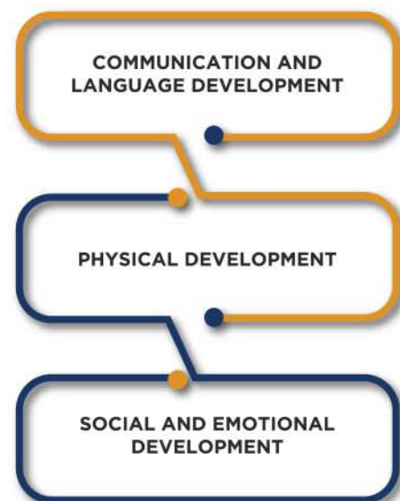
The 3 Core Areas

Personal, social and emotional development involves helping children to develop a positive sense of themselves, and others; to form positive relationships and develop respect for others; to develop social skills and learn how to manage their feelings; to understand appropriate behavior in groups; and to have confidence in their own abilities.